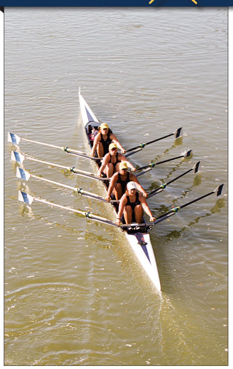
Members of the sculling squad race in the Sculling Invitational on Sept. 28, 2014, at the Cayuga Inlet. The team is in its fourth season.